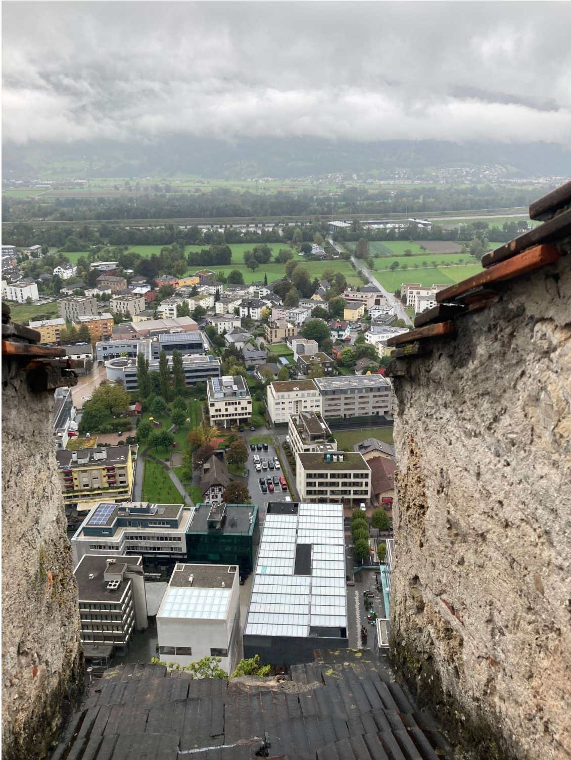
View from Vaduz Castle over Vaduz