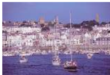
Guernsey is full of visitor attractions and places of historical interest