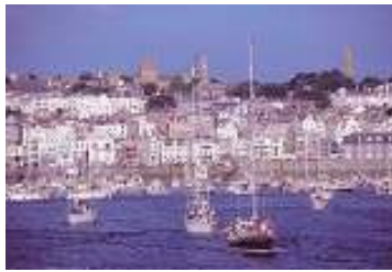
Guernsey is full of visitor attractions and places of historical interest