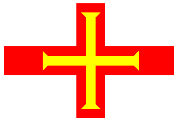
Flag is a mix of French Norman Cross and English George Cross