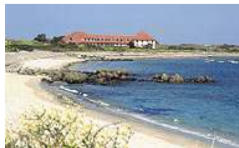
Venue hotel on Guernsey's sandy west coast