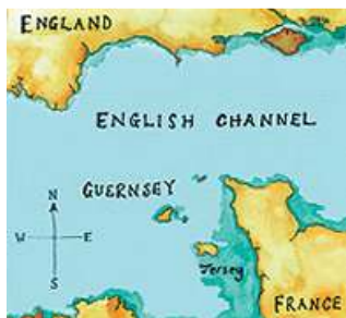
Location in English Channel