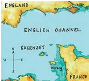
Location in English Channel