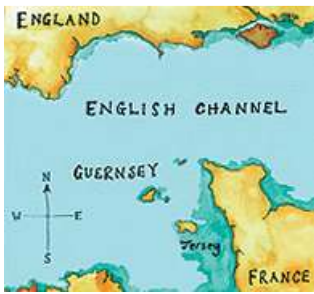
Location in English Channel