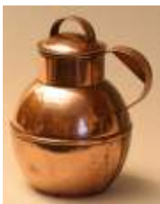
Traditional milk can