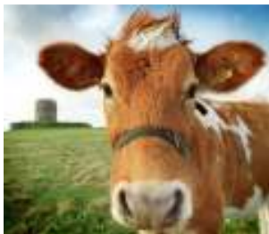
Guernsey cow and Martello tower in the background