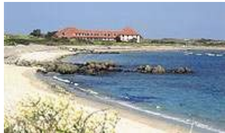
Venue hotel on Guernsey's sandy west coast