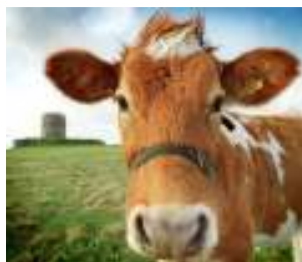
Guernsey cow and Martello tower in the background