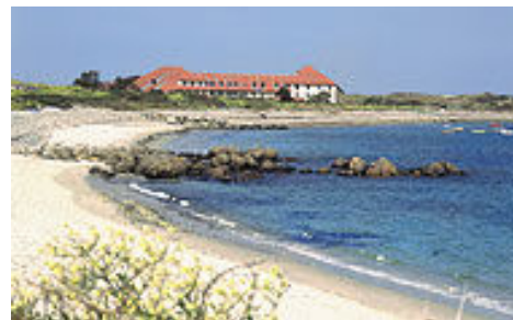
Venue hotel on Guernsey's sandy west coast