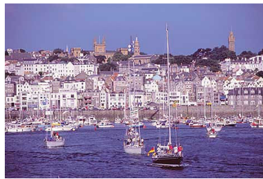
Guernsey is full of visitor attractions and places of historical interest