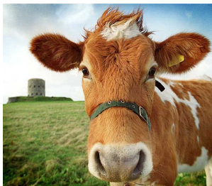
Guernsey cow and Martello tower in the background