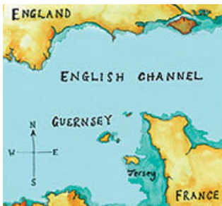
Location in English Channel