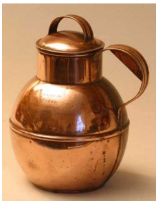
Traditional milk can