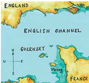
Location in English Channel