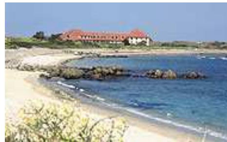
Venue hotel on Guernsey's sandy west coast