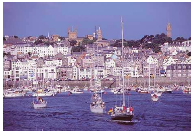
Guernsey is full of visitor attractions and places of historical interest