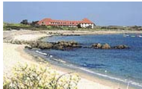
Venue hotel on Guernsey's sandy west coast