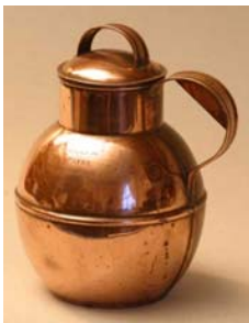
Traditional milk can