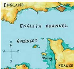
Location in English Channel